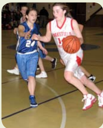
Maeve Dale Middle School Basketball