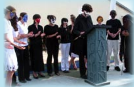
See more Antigone photos in an online slideshow at: wakefieldcds.org/Clubs/Drama.shtml